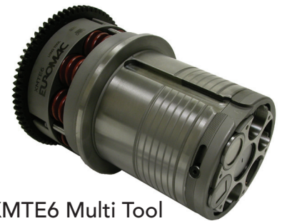
XMTE6 Multi Tool